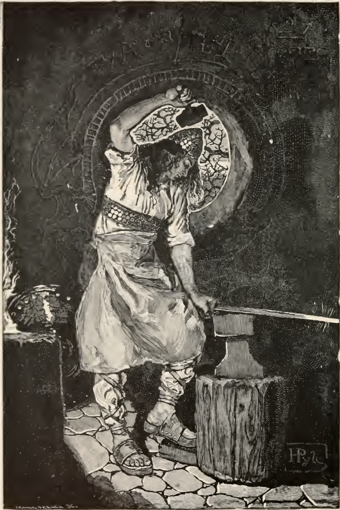
THE FORGING OF BALMUNG